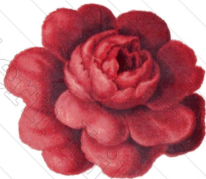
Strasbourg, print. Silbermann.