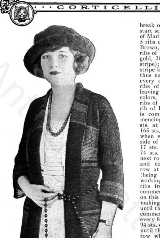
INDIAN STRIPED SILK TUXEDO No. 20A