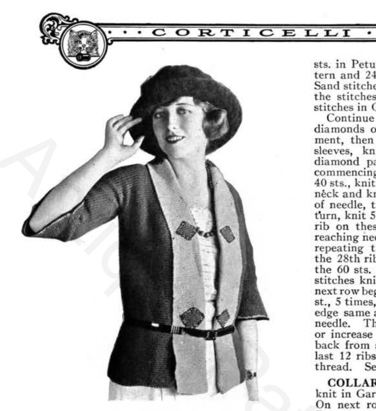
ARIZONA TUXEDO No. 18A