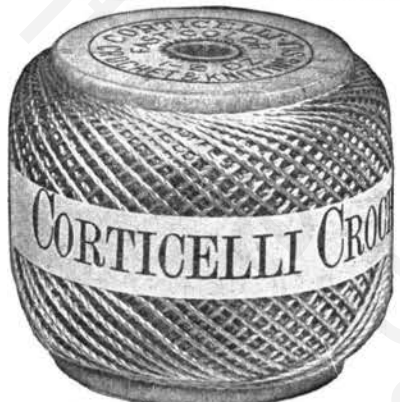
CORTICELLI ½ oz. (140 yards) on a Ball

573 Wild Rose Pink 1032.8 Laurel Green 573.5 Wild Rose Pink 1023 Emerald Green 1191 Pure White Emerald Green Cream White 1075.5 Old Rose 1075.4 New Rose 1080 Petunia 1019.9 Turquoise Blue 1026 Myrtle Green 909.2 Peacock Blue 904 Sky Blue 1193 Cream 1060 Scarlet 1062 Cardinal Baby Blue Cop'nh'g'n Blue Persian Blue 905 508 Light Orange 951.6 939.9 Peacock 792 Tussah Platinum Grey 1164 Platinum Gre 1173.5 French Grey Taupe Pongee 920.8 1138 915.2 612 Navy Blue 1124 1184.5 Elephant 989.5 Khaki Black Blue White 970 Medium Brown Dark Lavender Royal Purple 1190 1039.3 1036.7